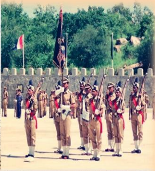
Academy receives the Presidents Colour