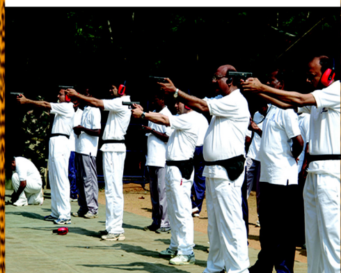
All India Shooting Competition for IPS Officers