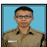
Ningshen Worngam Manipur-Tripura