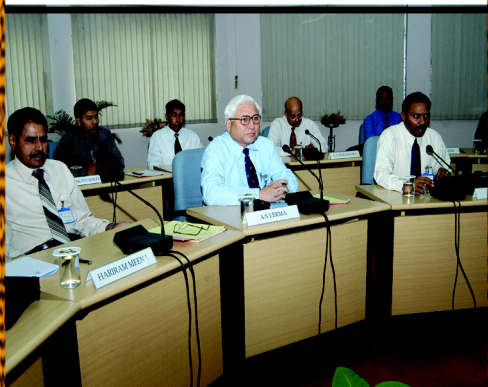
Easing up the atmosphere

The objectives of the course were to enable the participants - understand what computers and network are; understand the implications of the Cyber world & legal measures to harness it; understand basics of Cyber Forensics & Procedures for Investigation of Cyber Crimes.