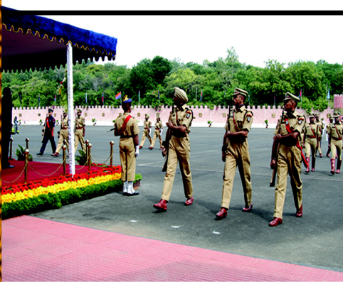
The best foot forward

of many an illustrious member of staff who served it. Every single member of the NPA family, since inception, has nurtured this Institution. What was once a barren rocky area at its present location has been transformed into scenery of greenery.