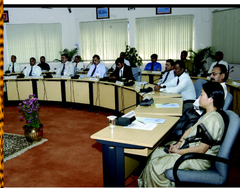
Back in class