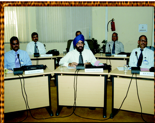
Point to ponder

The objectives of the course were to enable the participants - acquire