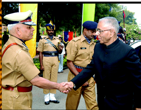
Shri M.K. Narayanan, NSA at the POP