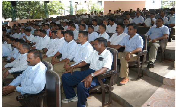
Quarterly Sainik Sammelans