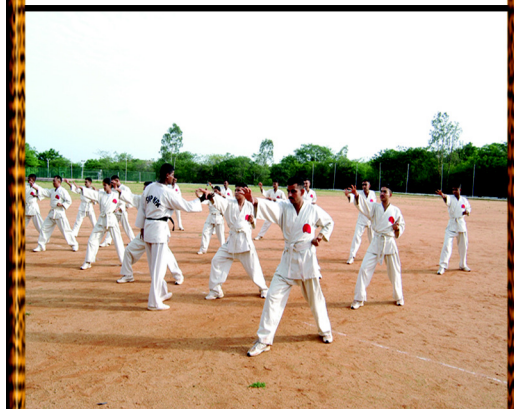
Shaping up the mind and body