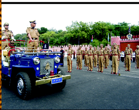
Smart turnout inspected