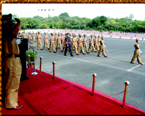
60RR marches in

Perhaps the most important quality of an officer of the Police Service