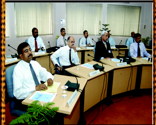
Catching the view point