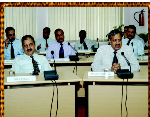
Another point for discussion