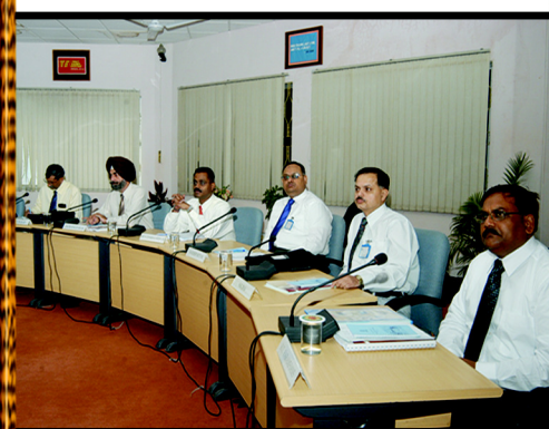
In deep thought