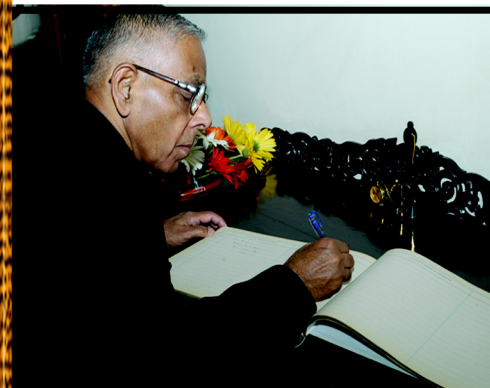
Etching the thoughts