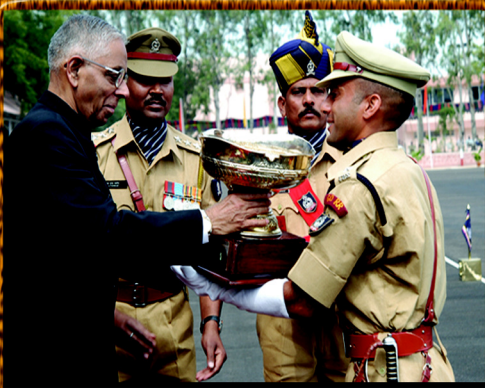
Smiling at achievements