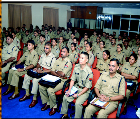
Moments of introspection