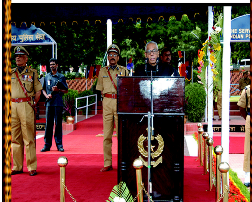
Valuable advice to juniors