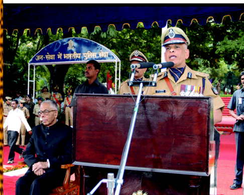
Director addressing the POP batch

Sardar Patel's advice to young officers at the dawn of our Independence in 1947: (and I quote) "Above all I would advise you to maintain to the utmost the impartiality and incorruptibility of administration. A Civil Servant cannot afford to, and must not, take part in politics. Nor must he involve himself in communal wrangles. To depart from the path of rectitude in either of these respects is to debase public service and to lower its dignity. Similarly no service worth the name can claim to exist if it does not have in view the achievement of the highest standard of integrity." The words of the great Sardar are the very essence of the teaching and philosophy that you should carry with you out of this Academy in order to discharge your duties in the field.