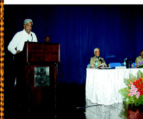
Interactions with eminence