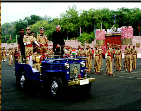
Inspecting the Parade