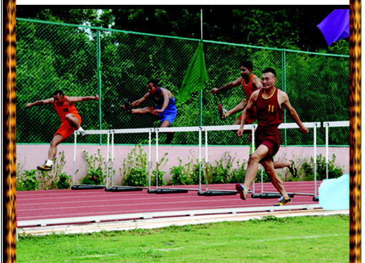
Nothing is too high