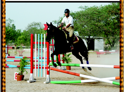
Jump to victory