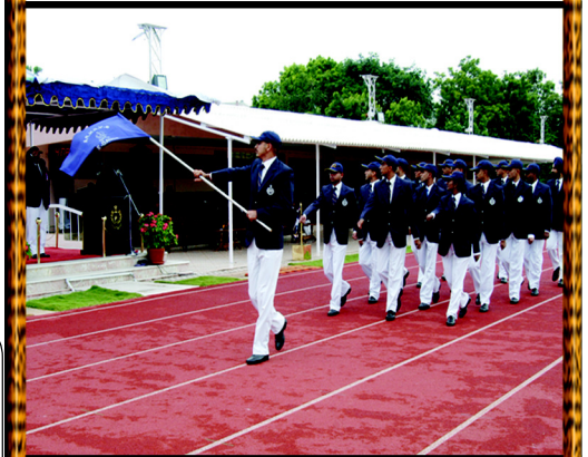
The Annual Athletic Meet