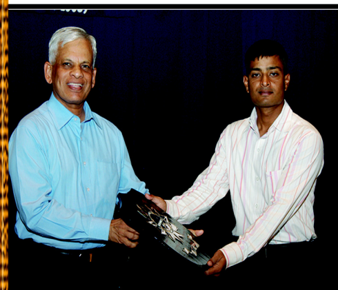
Culmination of training - victoriously