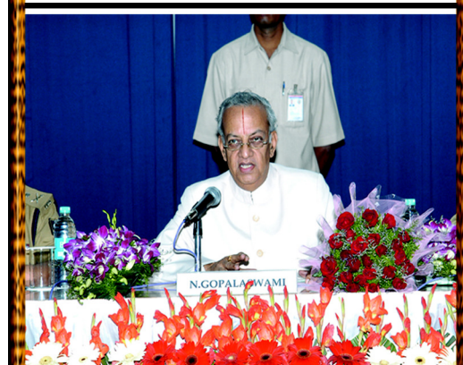
CEC delivering address