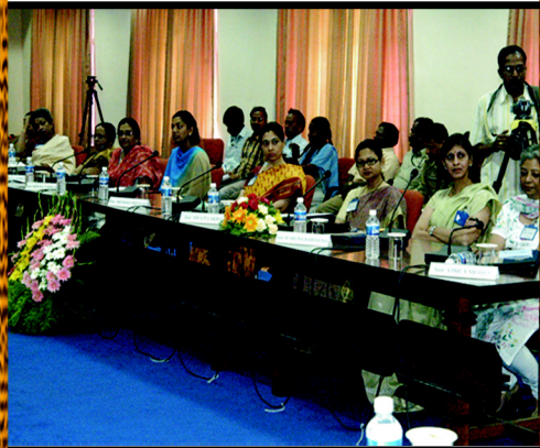
First All India IPS Women Conference