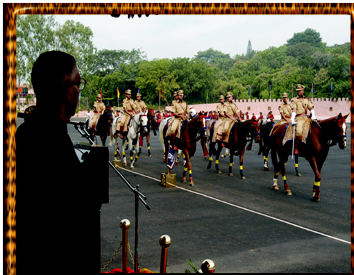
Fuelling horse power for a bright career ahead

The only instrument that can deal with this in a rule-bound manner is the police, who not only have the capacity to employ the requisite amounts of force, but also ensure that where force is used it is tempered by reason and justice. Whether it is ensuring 'Zero Tolerance of Terrorism', sensitive handling of Naxalite situations or dealing with communal/ethnic issues with understanding, it is you as leaders of the Police Force who will have to ensure that the right methods and means are adopted, avoiding the shortcuts or short-term remedies that could lead to the unraveling of our inclusive social fabric. You will need to develop a perceptive understanding of the social forces at work, the ethnic