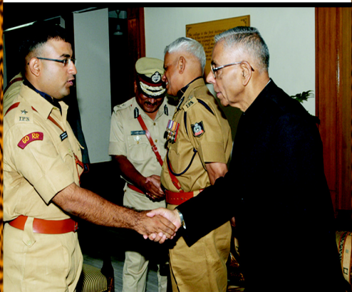
A special handshake