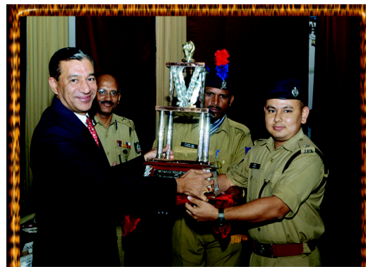
The big reward