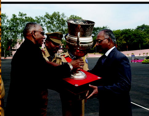
The P.M.'s Silver Cup