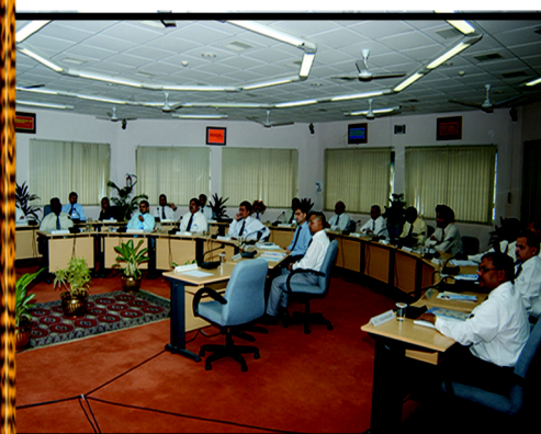
All ears and eyes