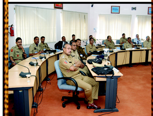
In rapt attention