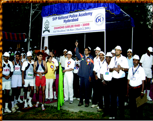
10K Marathon Run