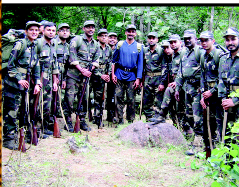
Come what may...ready to take up