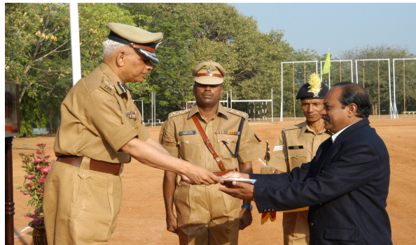
Highly motivated staff-performers of the month awarded