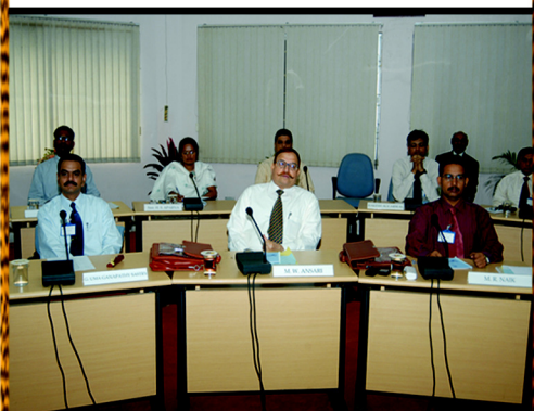
Lost in thought