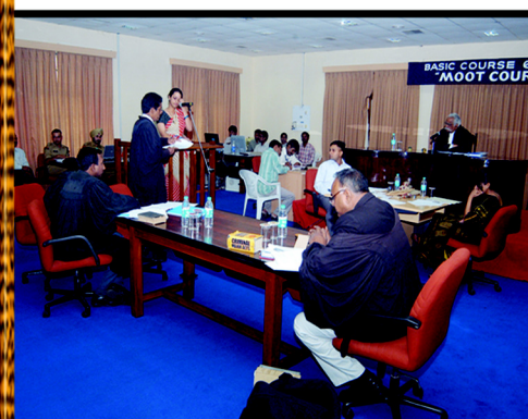
Moot court sessions