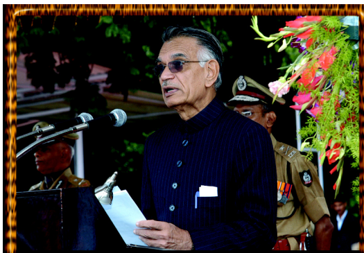
Hon'ble Union Home Minister