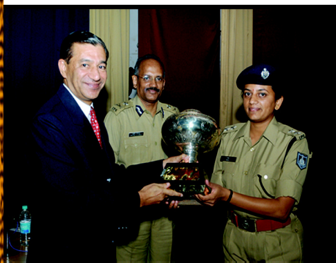
Trophy for Exemplary Conduct