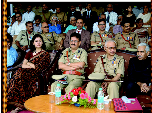
The smiling seniors