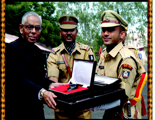
The best Officer Trainee