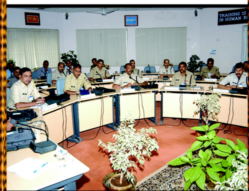
Schooled to listen