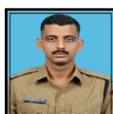
Ishu Sindhu Maharashtra