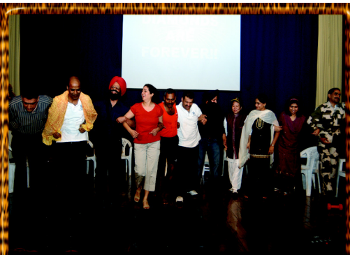
The faculty act