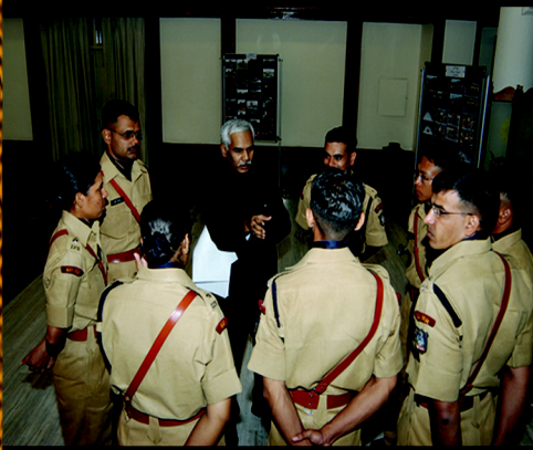
Officer Trainees interacting with VVIP