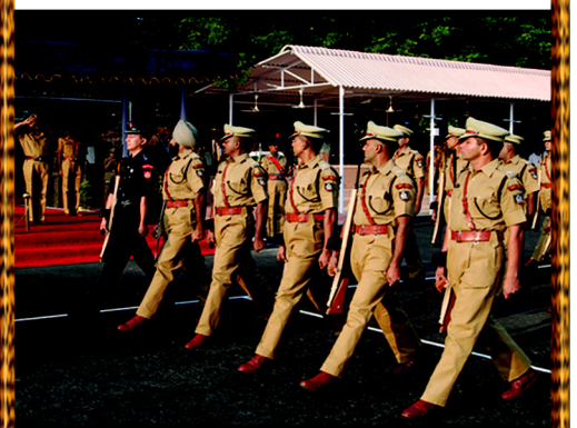
Perfect steps in unison