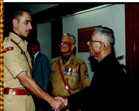
Learning from experience