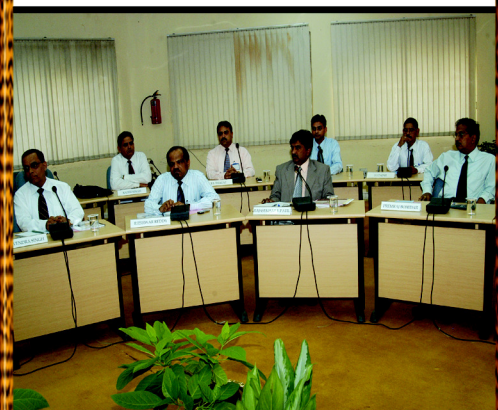
Those good old days!!