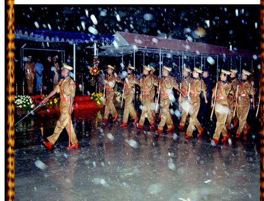
The Diamond Jubilee commencement Parade