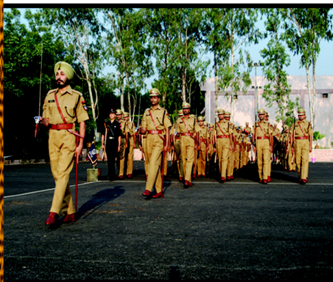
The sure footed youngsters