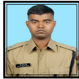
Ravi Shankar Chhabhi Uttar Pradesh