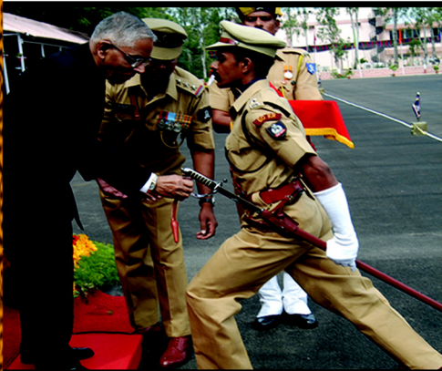
The Sword of Honour