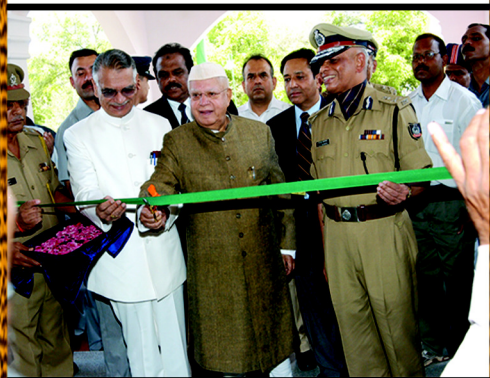
Inauguration of Diamond Jubilee Complex