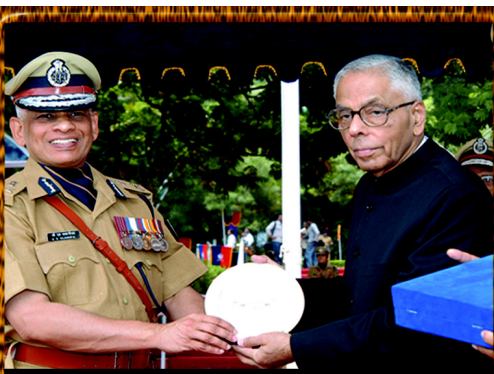
Token of love from Alma-mater

There is a gold mine in each one of you. You must have the courage and the conviction that you can improve the world through your actions. Success is an attitude and I am confident that each one of you will make it your personal endeavour to realize the dreams of the great