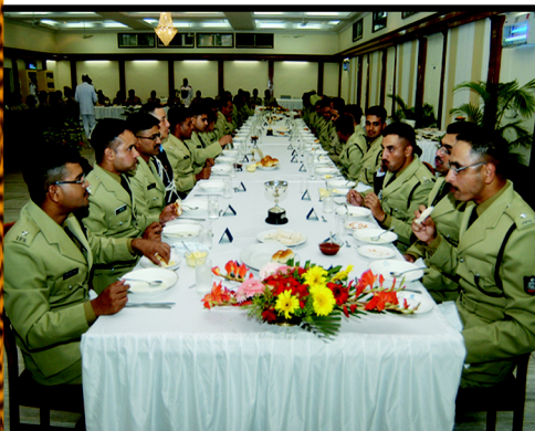
The service dinner