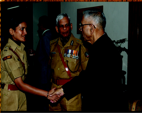
Shaking hands with the smiling future of police