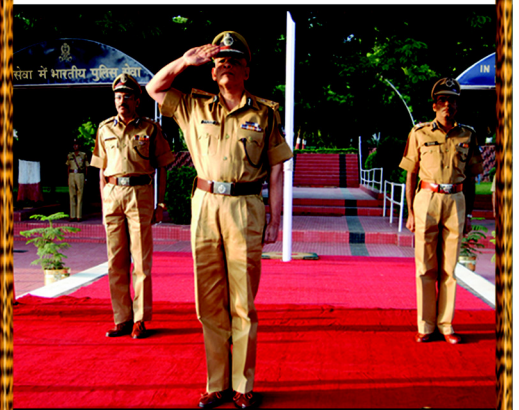
The Director takes the salute