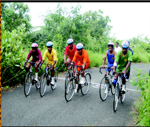
Together toward laurels