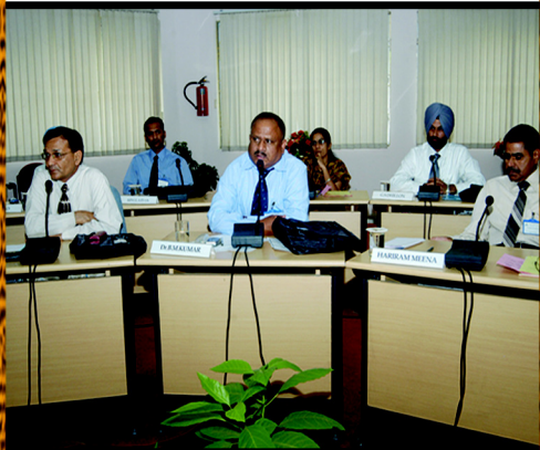
That is the point