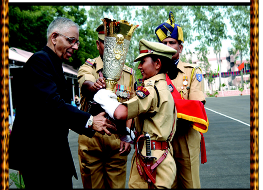
The best lady Officer Trainee