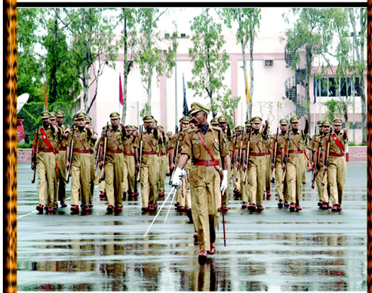
Diamond Jubilee Closing Parade