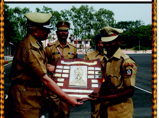
One for the camera