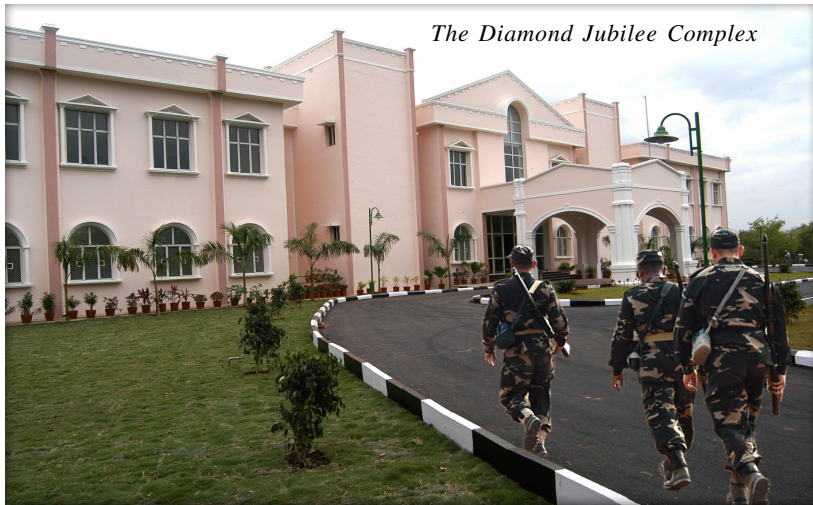
The Diamond Jubilee Complex