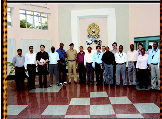
Visitors from 21 nations