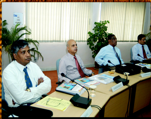
All eyes focussed