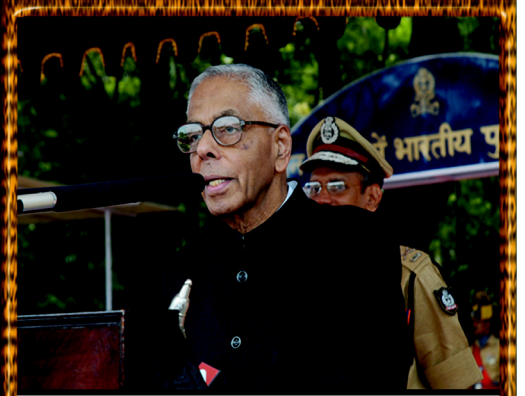
Chief Guest expressing his views

If experience of older generations has any meaning for today's youth, it is that the principles, the attitudes and the concepts learnt in institutions of excellence such as the National Police Academy can be the lodestar for navigating the dangerous shoals of everyday problems.