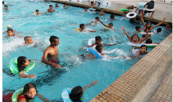
Childrens Summer Camp -08