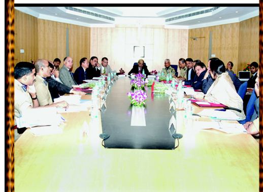
NPA Board Members