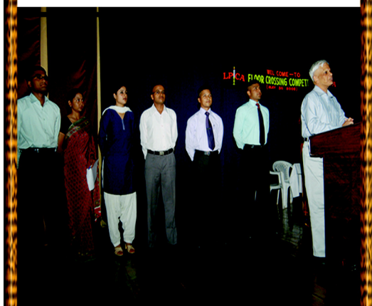
Strong on co-curricular activities