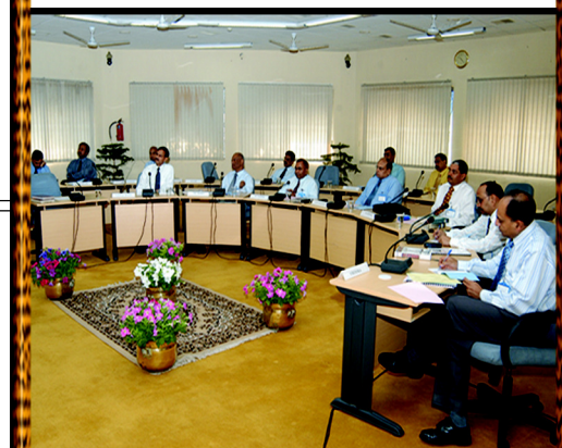
Notes for reference