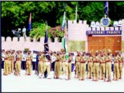
Oath to serve