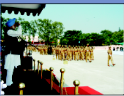
The Prime Minister takes Salute