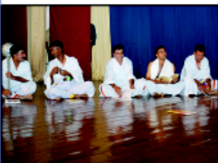
The 'gurukul' act' by probationers

The Passing Out Parade Week of the 58 th RR batch of IPS Probationers get to roll on with the Valediction Ceremony at the Service Dinner at the IPS Mess on 23 rd October, 2006. In a simple yet elegant ceremony, the Director gave away some of the trophies like Shri Teja Singh Memorial Trophy for Criminology, Commdt. PL Mehta's Cup for Periodic Evaluation, Manipur Cup for Law, etc.,