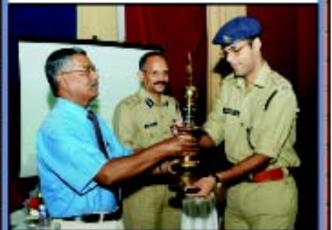
Best at Internal Security challenges