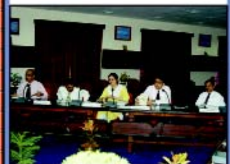
The faculty in student chairs