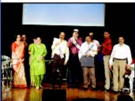
The Faculty Act