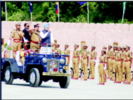
Inspecting the 58RR