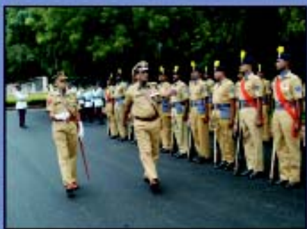
The final guard of honour