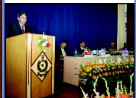
Interaction with 59 RR