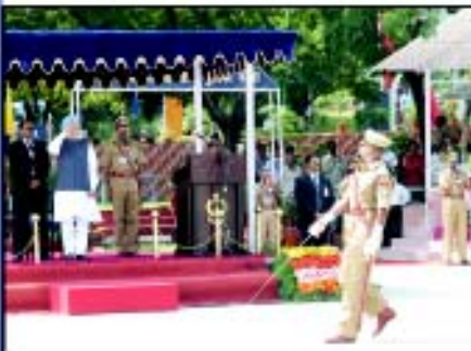
Parade Commander's salute