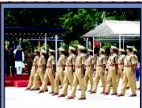
Smart steps in smarter turnout

With these words, I thank you, once again, Sir, for being with us today. May I now request you kindly to distribute the medals and trophies to the awardee probationers? Thank you, Sir. Thank you, Ladies & Gentlemen.