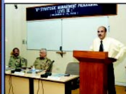
Management .. strategy