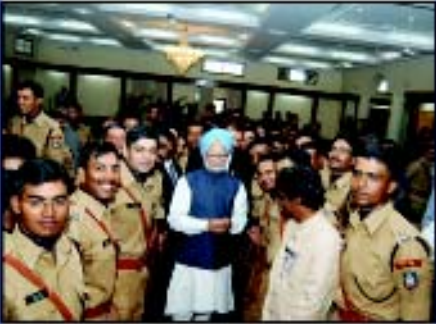
Smiling with the future of the Police