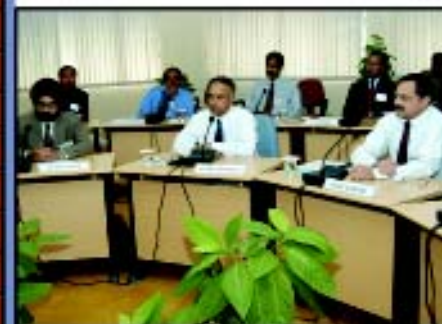
Strategies being worked out