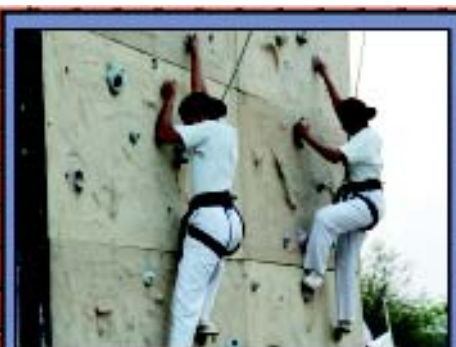
Going from step to step

To ensure that the probationers; the future leaders of the service are close to their men in the field due attention is given to imparting skill in team games to the probationers. The final of Inter Squad Hockey played between Squad 3 and 1, was won by Squad 3 by 3-1.