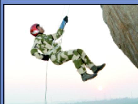
High on enthusiasm