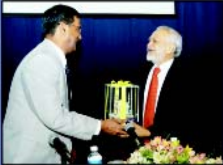
Fond remembrance with affection and smiles