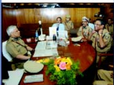
The new chief "in position"