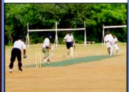
Playing the gentleman's game