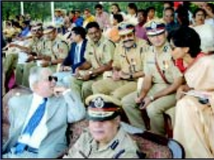
Proud senior's smiling