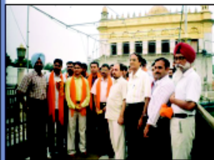
Getting to know the roots