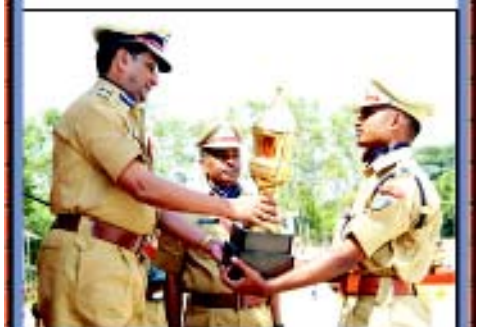
The best turnout acknowledged