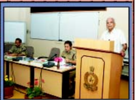
Welcome back to school