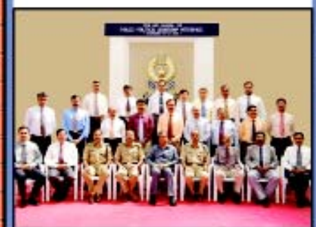
For later years