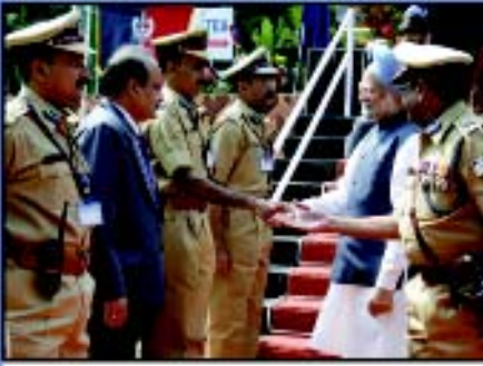
Getting introduced to the 'Gurus'