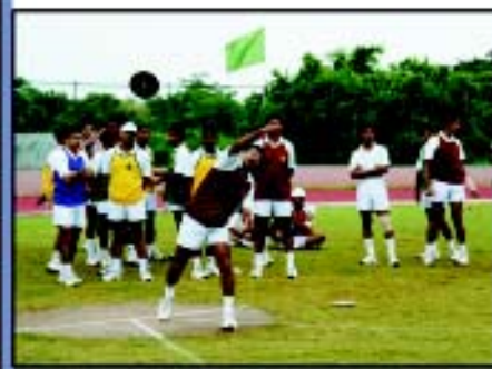
Strength and skill, both