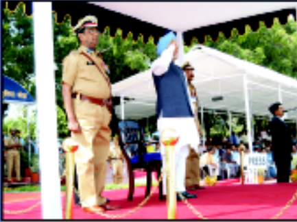
Hon'ble Prime Minister at the Parade

Our nation is on the march and is being transformed beyond recognition. Society is changing at a pace never imagined before. This is inevitably giving rise to tensions which are inevitable in a poor country trying to modernize itself. Nearly 70% of our people live in rural areas. As such, the public administration in our country must have an in-depth knowledge and awareness of problems faced by the rural population. Particular attention ought to be paid to control caste based violence and atrocities against weaker sections. At the same time, we have to recognize the growing pulls of urbanization. Large urban agglomerations are throwing up organized crime in a manner not foreseen in the past. White collar crime is taking on new dimensions. Sophisticated instrumentalities are available to criminals which need to be countered. This requires knowledge of new disciplines and new ways of tracking such crime. You will have to understand the complexity of forces influencing the march of our polity. Only such understanding will enable you to handle your work in an effective manner.