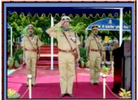
The Director takes the salute