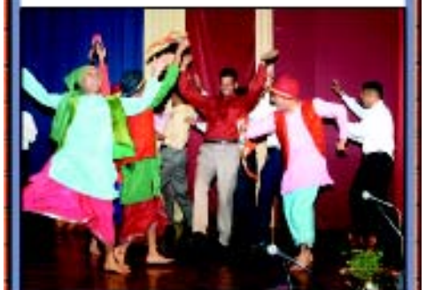
Perfect at Bhangra too..