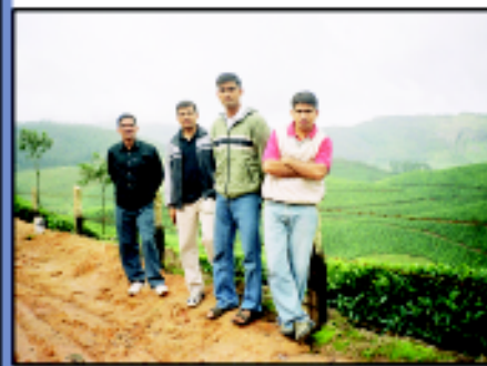
The unraveled Kaleidoscope, India