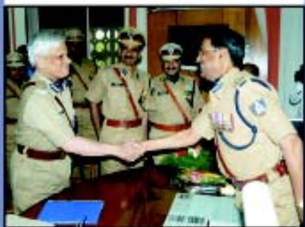
Wishing each other good luck