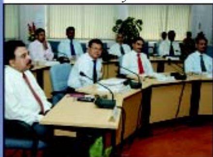
In rapt attention – all