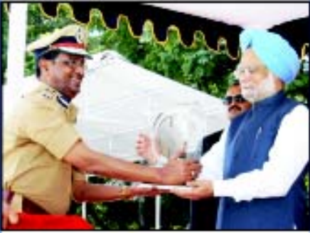
Token of affection presented