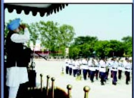
The musical salute