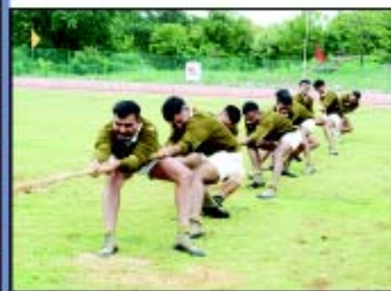
We are strong, together