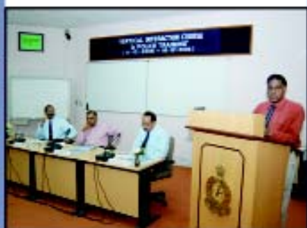
Feedback of the course, presented