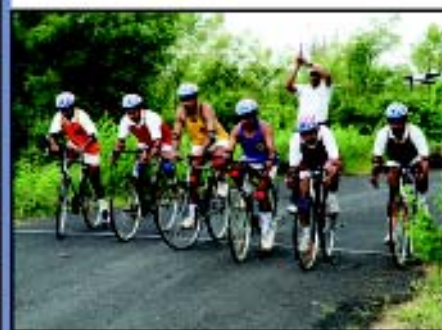
Together towards laurels