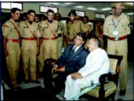
Probationers interacting with the guests