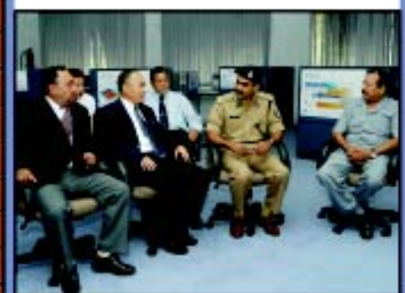
The Bhutanese officers at the Cyber Forensics lab