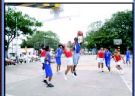
Beaten by the young ones'