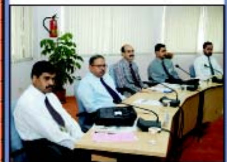
The participants ponder over