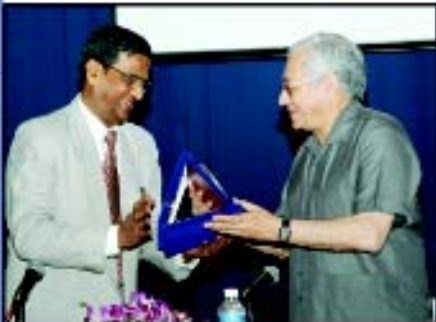
With love from NPA family