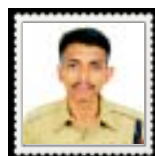
Akbar A Kerala