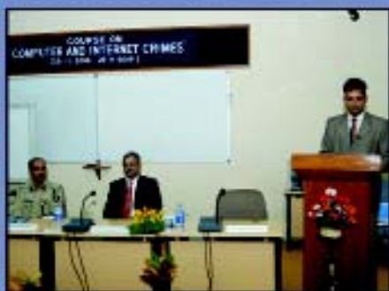
Keeping with the changes