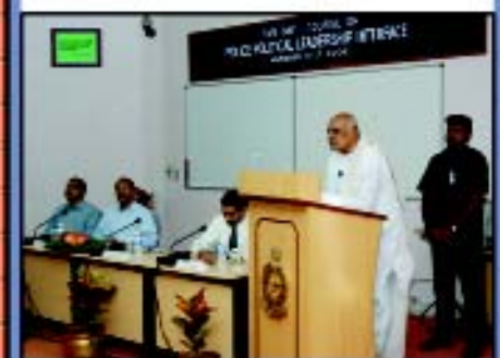
Getting to know each other