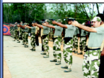
Learning to zero in on targets