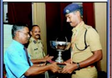
Topper of the 57RR batch