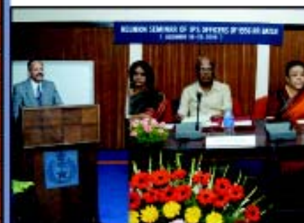
The 50 golden years marked