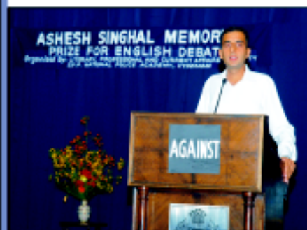
Debating their viewpoints