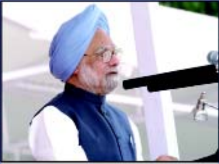
Prime Minister expresses his views