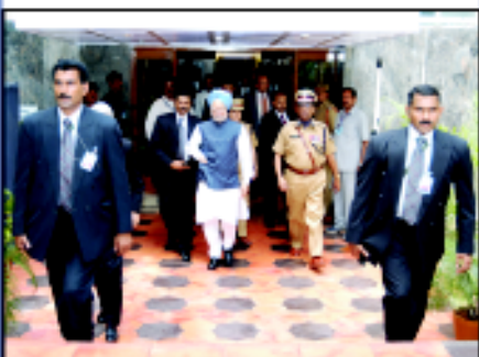
Prime Minister coming out of Central IPS Mess