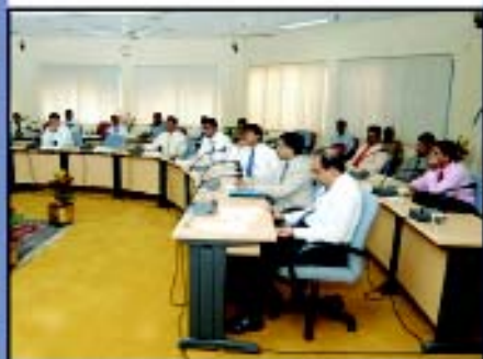
Getting to know Internet Crimes