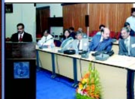
Back for the silver jubilee