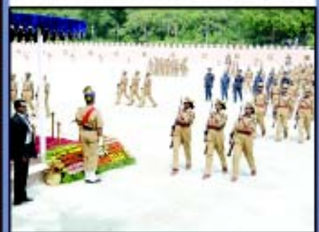
Peeling off to serve