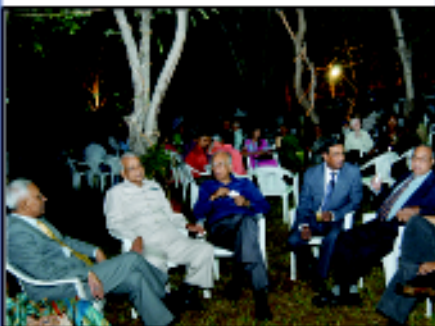
The guests at Vallabh Vatika