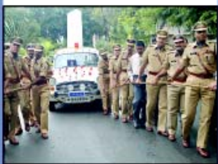
A fond farewell