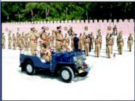
Smart turnout inspected