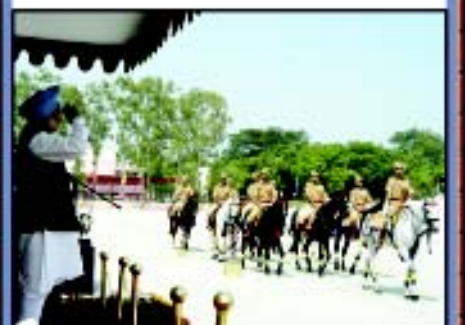
Fuelling horse power to the steel frame of India