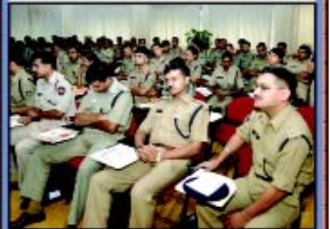
Moments of introspection