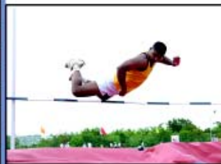
Nothing is too high