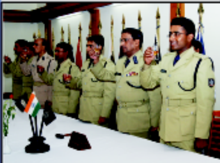
Toast to the President at the Service Dinner