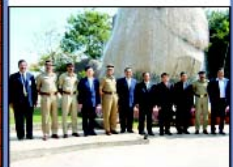
NPA faculty with friends from Myanmar