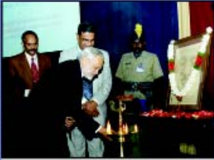
Tributes to the Mahatama