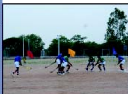
Learning to be a team