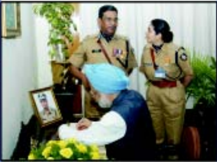
Prime Minister etches his views in the visitors book at the Central IPS Mess