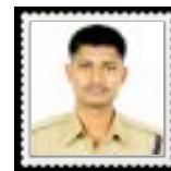
Kabib K Manipur-Tripura