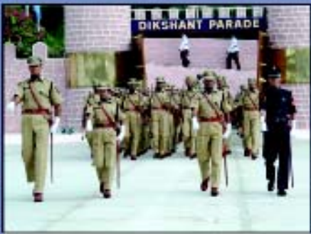
58RR marches in