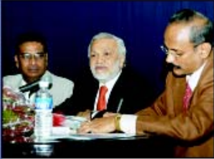
Gandhian Values revisited