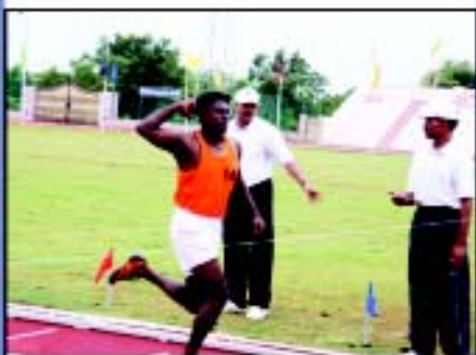
All sincerity and strength