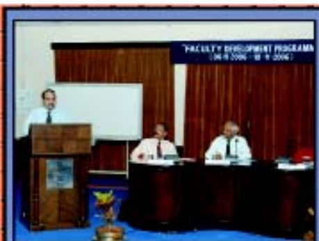
Development begins with us