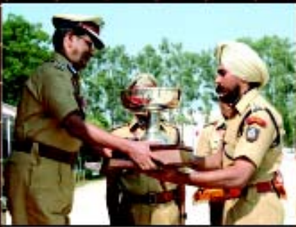
Well done boy – keep it up!!