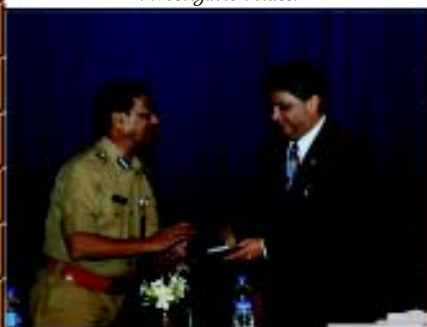
The Director presenting a Memento to Home Secretary