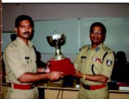
56RR culminates training with victory