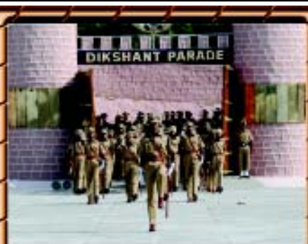
Probationers of 57RR marching