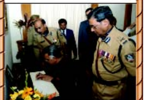
Shri Shivraj V Patil etches his comments