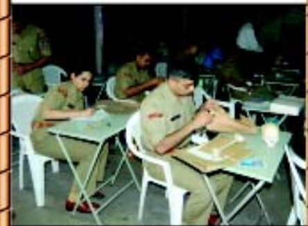
Examination during Examination