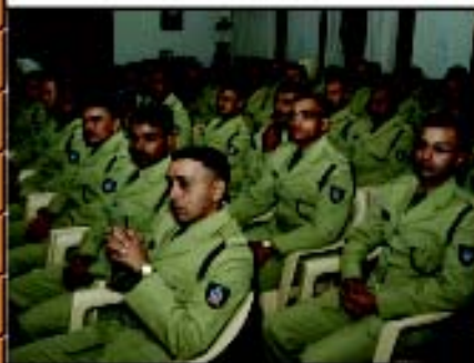
Probationers waiting in anticipation during Valediction Ceremony.