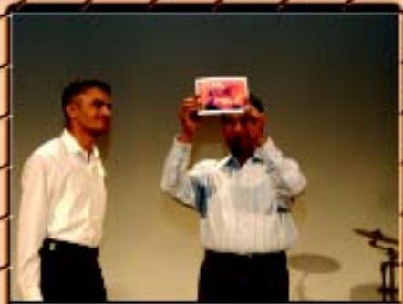
The Batch book released