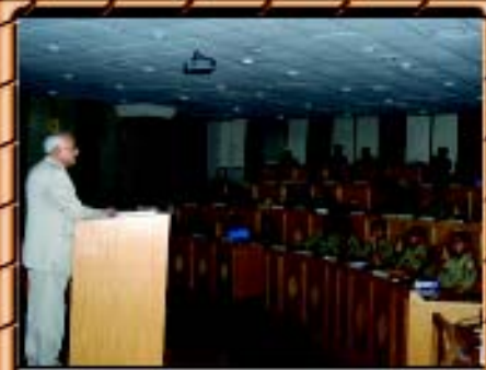
Learning from 'Experience'