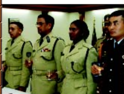
Toast to the President