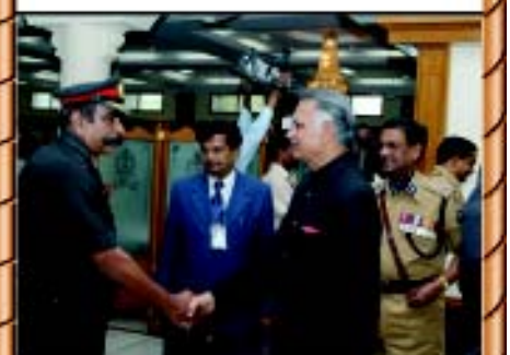
Guests introducing themselves to the VVIP.