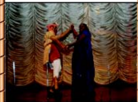
Cultural Night extravaganza!!