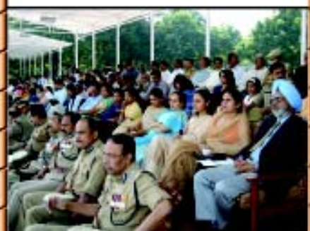
Without batting an eyelid - dignitaries enthusiastically watching the parade