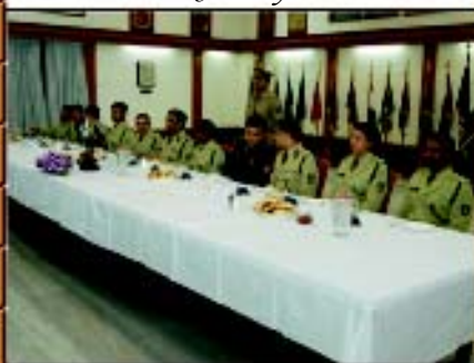
Probationers at Service Dinner