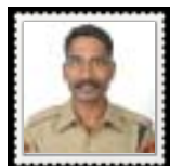
A GBABU Tamil Nadu