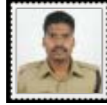
K EJILEARASSANE Uttar Pradesh