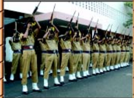
A volley of fire – during Martyrs' Day