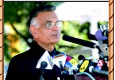
Hon'ble Home Minister Shri Shivraj V Patil, giving his message to the probationers.