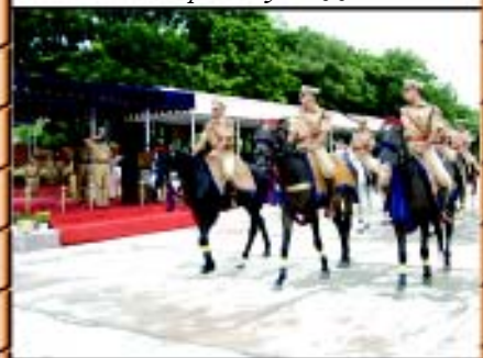
Saluting the Guru.