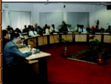
Cross-section of the participants of the Strategic Management Course