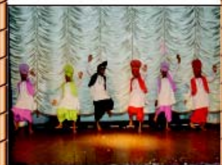
Probationers high on Punjabi Spirit