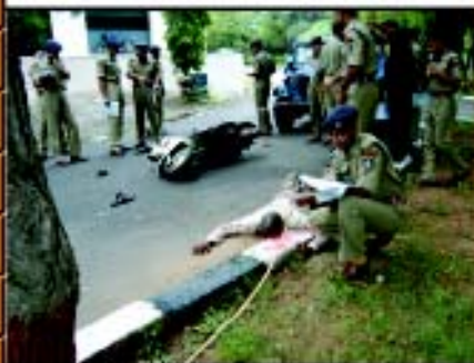
Investigation – a simulation class under progress