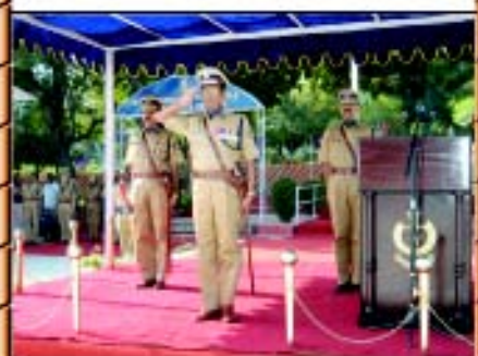
A proud Guru receives the salute.