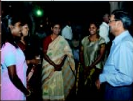
The host entertains the guests.