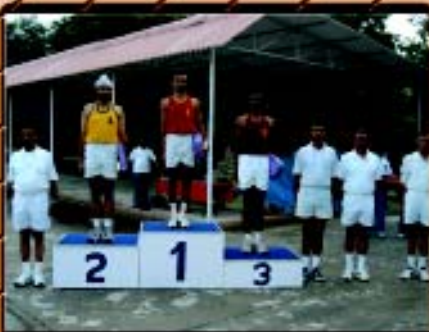
Victories hard earned