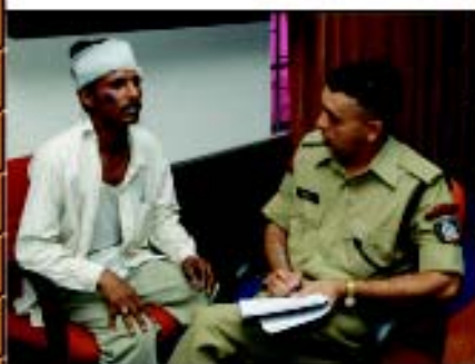
How to elicit information? A scene from investigation class.