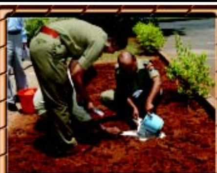
Learning to investigate