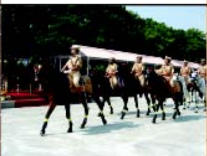
Fuelling horse power to the steel frame of India

The threats of terrorism, communal strife, violent conflicts and organized crimes are the most important concerns in policing today. The gravity and pervasiveness of the threat posed by terrorism has been brought home once again, recently. Thousands of Indian citizens have lost their lives, in the recent decades, as a direct result of terrorism. India has consistently maintained that terrorism constitutes to be one of the most serious threats, not only to peace and security of the society but to civilized society itself, and has to be dealt, with grit and determination. You are going to be in the vanguard of this fight. This grave challenge has to be met squarely, and with uncompromising professional zeal and indomitable spirit. You have to do so while always upholding the principles of rule of law and the democratic and constitutional values, cherished by the Indian nation.