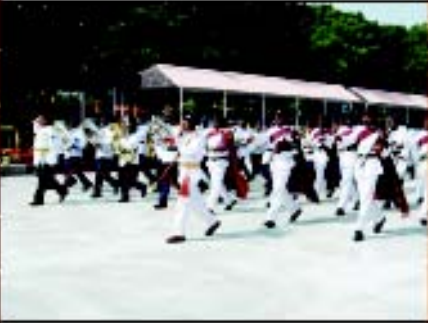
The NPA Band playing their Tunes