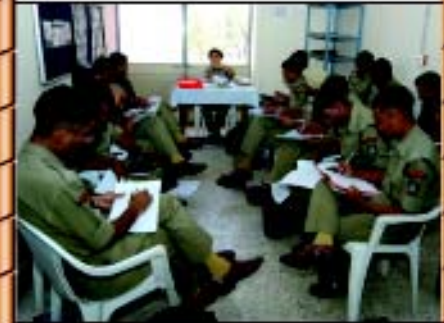
Picking up the finer nuances of writing F.I.Rs