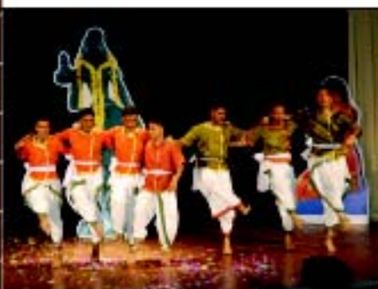
Shaking a leg – probationers presenting a cultural programme.

The National Police Academy, in its 57 years of existence, has constantly strived to translate the dream of its founder, Sardar Vallabhbhai Patel - the Iron Man of India - to achieve its due status as the premier police training institution of the country. The Academy has, indeed, acquired a name for itself for excellence in police training not only nationally but internationally too.