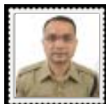
SABYA SACHI West Bengal