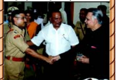
Probationers interacting with the VVIP.