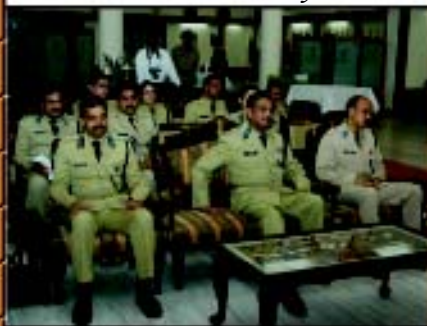
Faculty of NPA during the Valediction Ceremony.