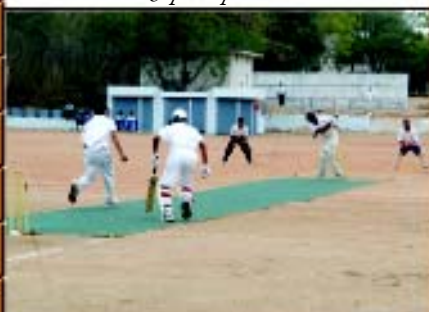
Not Out!! – Probationers during an exhilarating cricket match