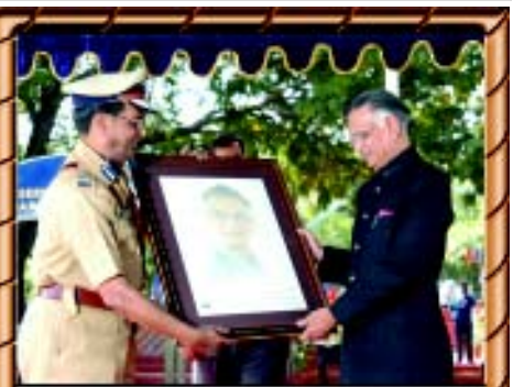
The Director presents a memento to the Home Minister