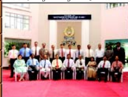
Participants of the in-service course on 'Investigation of Frauds and Scams'