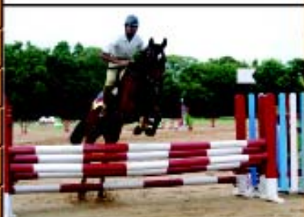
Firm on saddle – IPS Probationer during Tonk Cup competition.