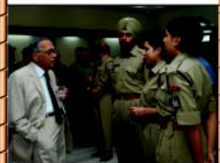
Interaction with eminence