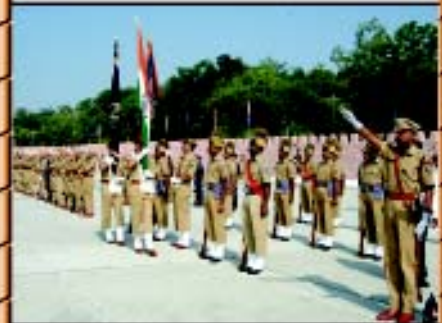
Oath taking ceremony of 57RR probationers during Passing Out Parade