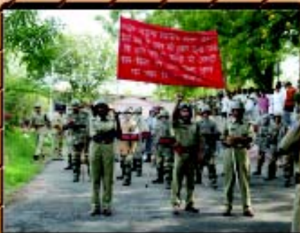
Riot Drill simulation – fine learning points.