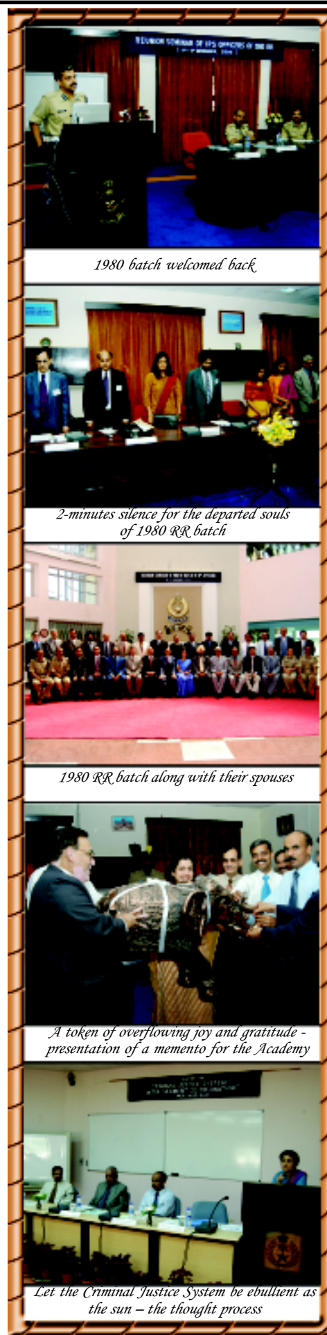
1980 batch welcomed back.