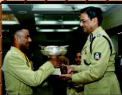
The smiling winners

As many as 6 Route marches of various distances ranging from 10-30 kms were organized. The aim of these route marches was to help the probationers improve their endurance limits and learn tactical exercises enroute such as exercises on Ambush, so that they are sensitized to need for proper formations, command and control during naxalite area patrolling. During route marches they were also shown various sites of tactical importance