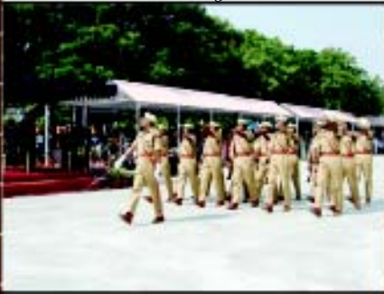
Marching ahead of times – in service of the nation.