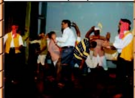
The Director shaking a leg during a cultural programme.