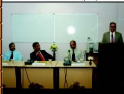
Strategic Management Course inauguration function