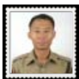
THEMTHING N Manipur & Tripura