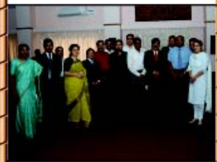
Faculty interacting with Bangladesh Police Officers