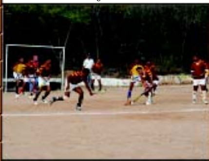
A game well played