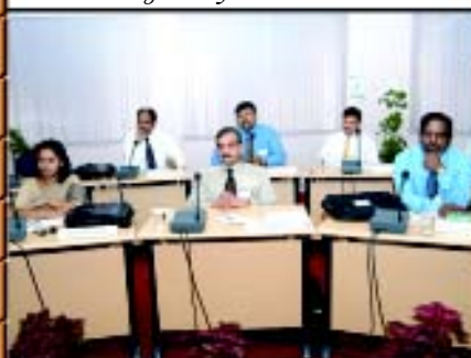
Participants pondering over the points on Frauds and Scams