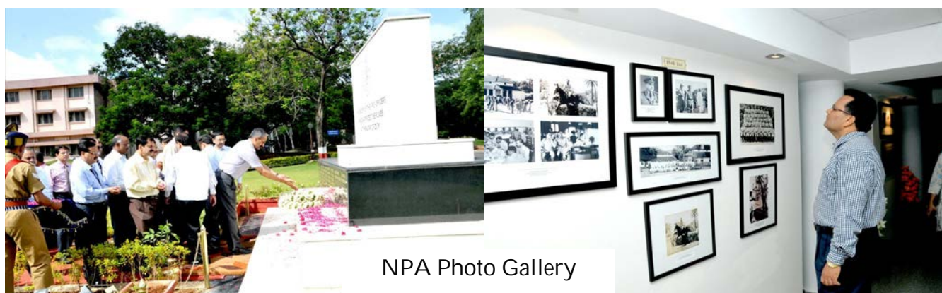
NPA Photo Gallery

49 IPS Officers of 1988 Batch Participated in the seminar which was inaugurated by Shri Subhas Goswami, Director, SVP NPA. Theme of the seminar was "Cyber Crime-Are we ready?". The Challenges faced by the law-enforcement agencies due to the increase in cyber crimes was discussed in detail during the seminar. It was concluded by the batch that police must take lead in issues connected with cyber crime in coordination with various agencies as it is the only agency which can investigate and prosecute cyber criminal under IT Act.