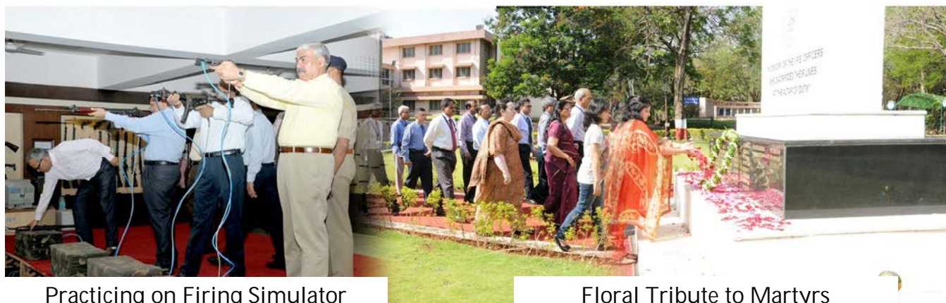
Practicing on Firing Simulator