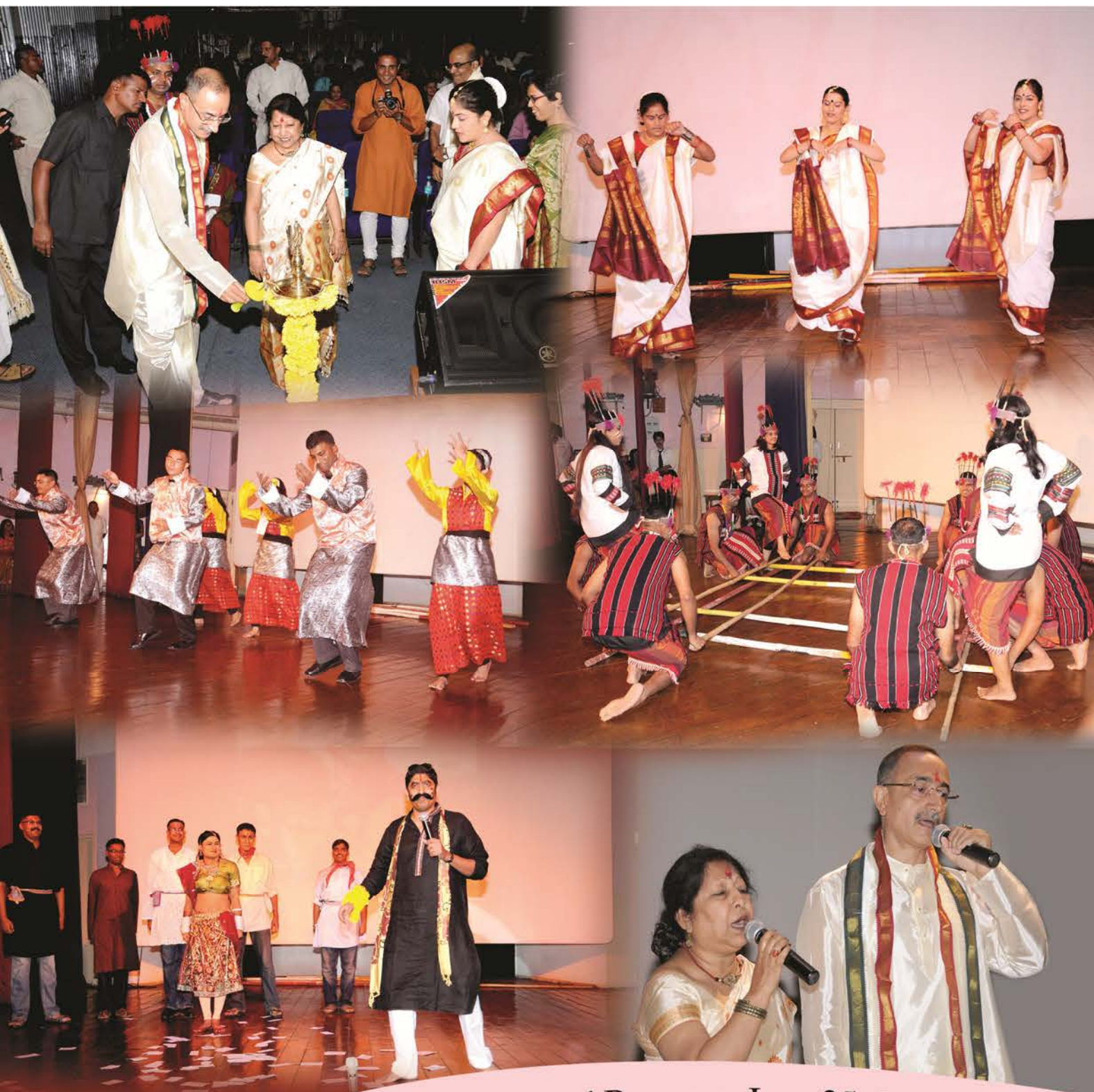
East Zone Cultural Program, June 25, 2013

Published by Sardar Vallabhbhai Patel National Police Academy Hyderabad