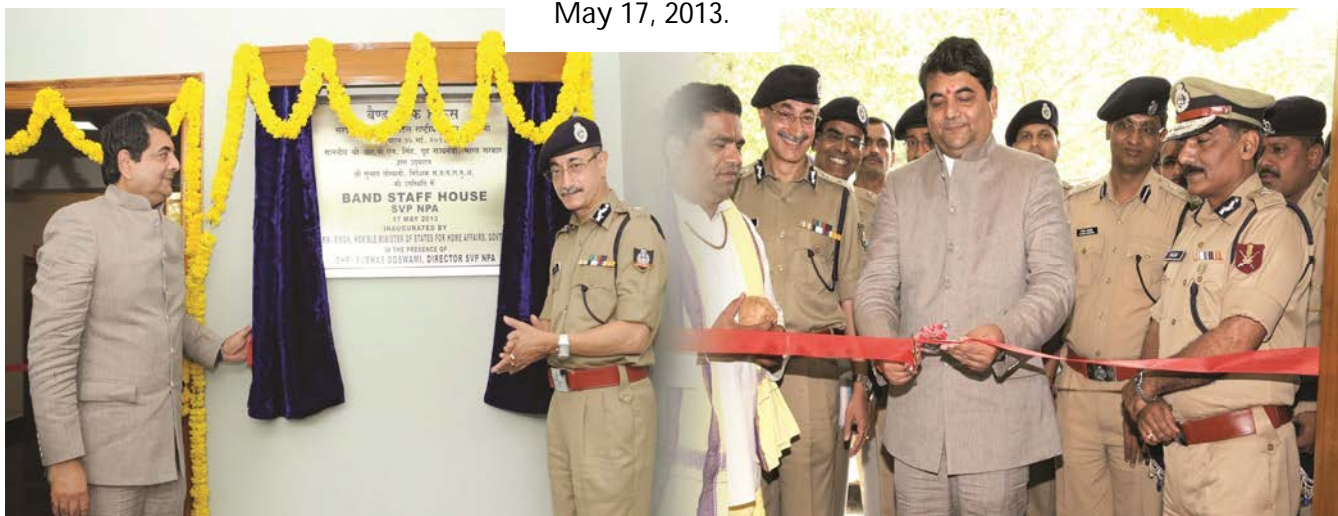
Shri R.P.N. Singh