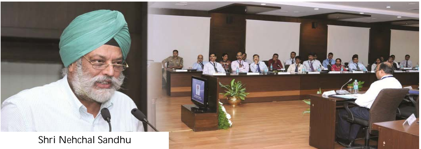
Shri Nehchal Sandhu

48 Participants (03-IAS Officers, 14 -IPS Officers, Assam Rifles-02, CPO's-09, Other Orgn-20) participated in the seminar which was inaugurated by Shri Nehchal Sandhu, Dy NSA, New Delhi. The participants were given inputs about different dimensions and elements that constitute National Security as well as threats to such security. It gave an opportunity to the participants to interact and exchange ideas on National Security.